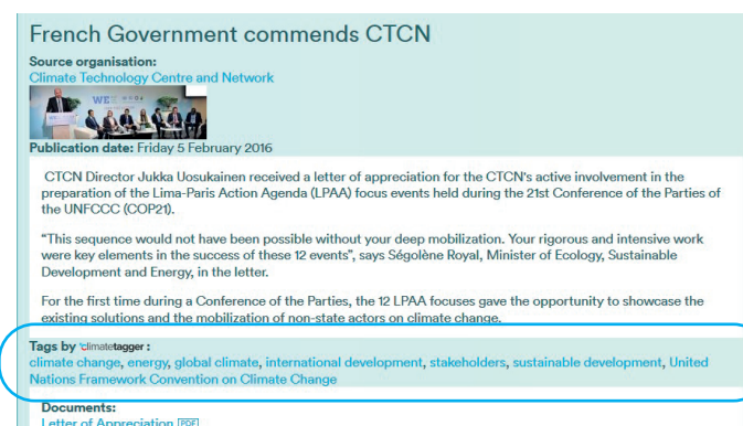
Screen-Shot: CTCN News & Media , Content Classification by the Climate Tagger