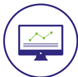
Data Analytics & Visualization