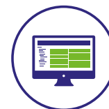
Dynamic Content Publishing